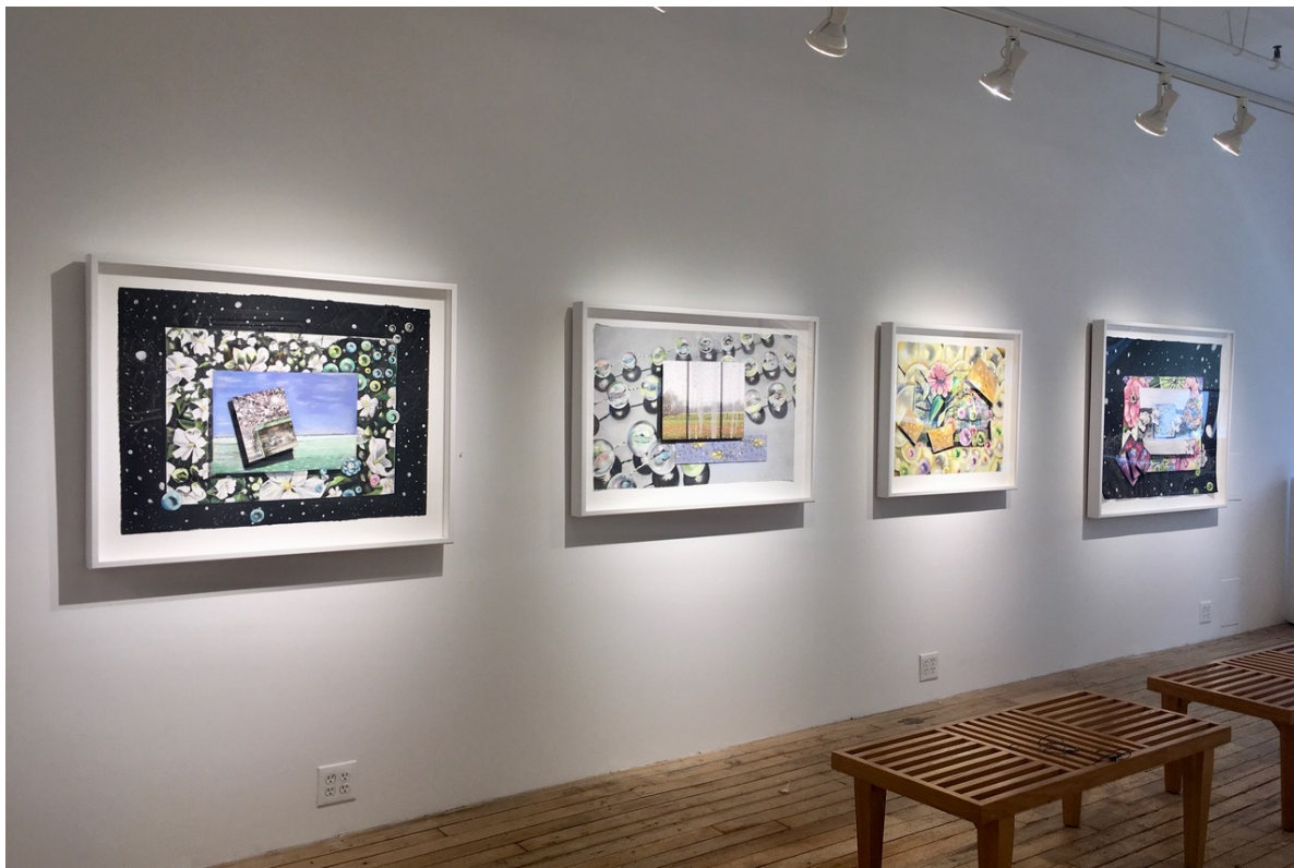
Carter Burden West Gallery