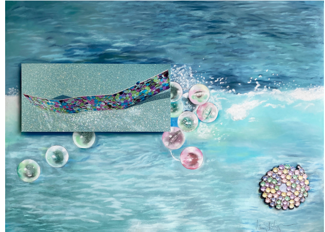
The Wave of Sparkle

I was featured in the literature and art magazine Catamaran Spring issue. Three of my pieces were shown, along with a brief artist profile. Click HERE to see a PDF of the feature.