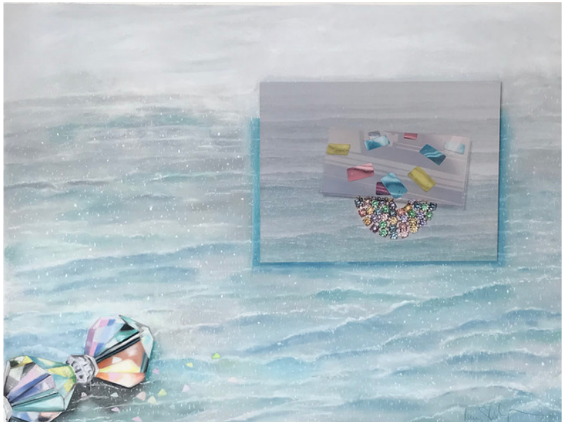
The Color of Precipitation

I was also the Featured Artist in the May issue of Sanctuary , an online magazine for women and their creative vision. Click HERE for the link to the article. Two of the works featured are shown below.