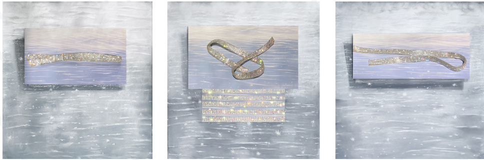
LIGHTENED EXHILARATION OF SPARKLE