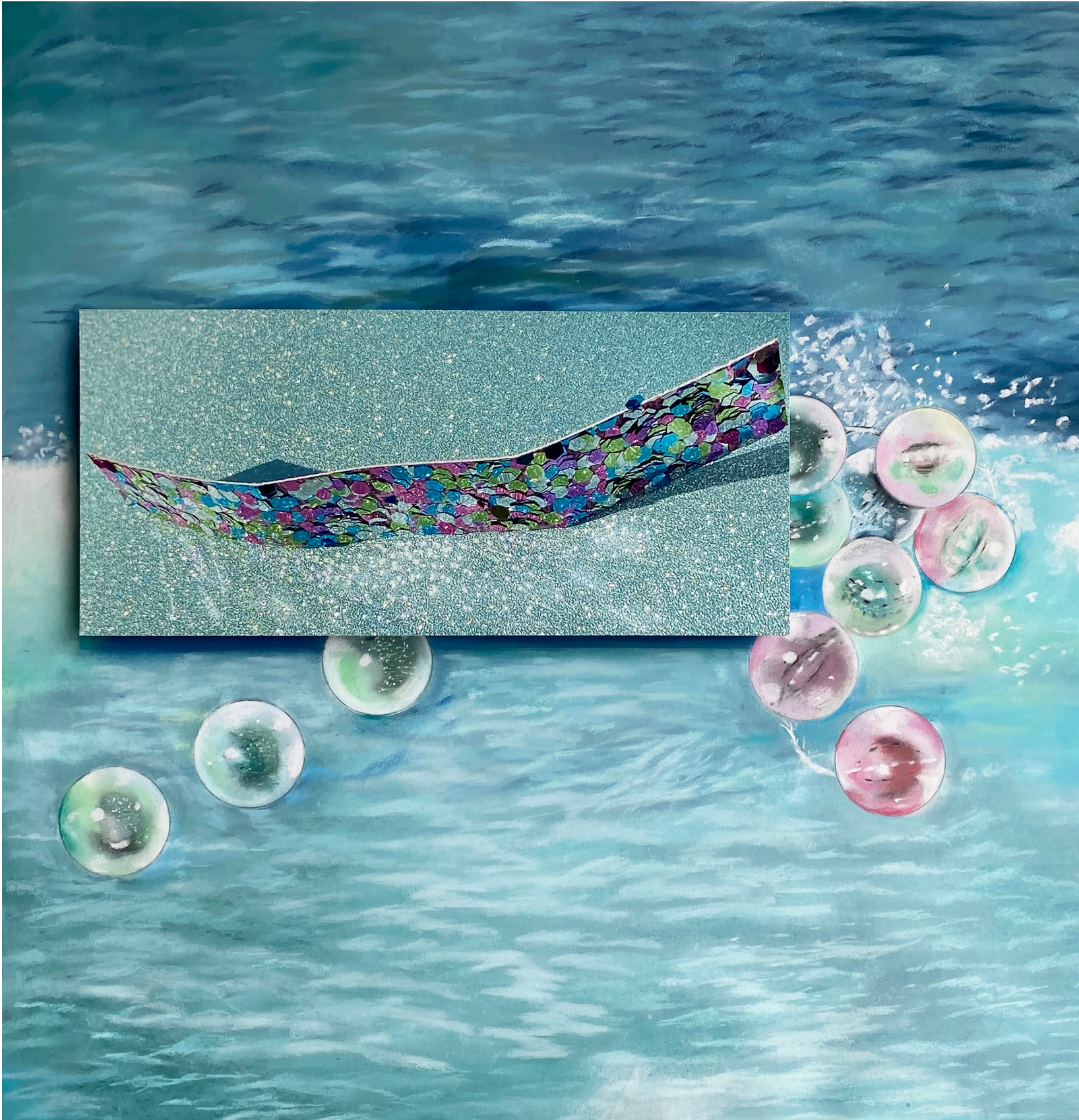
THE WAVE OF SPARKLE