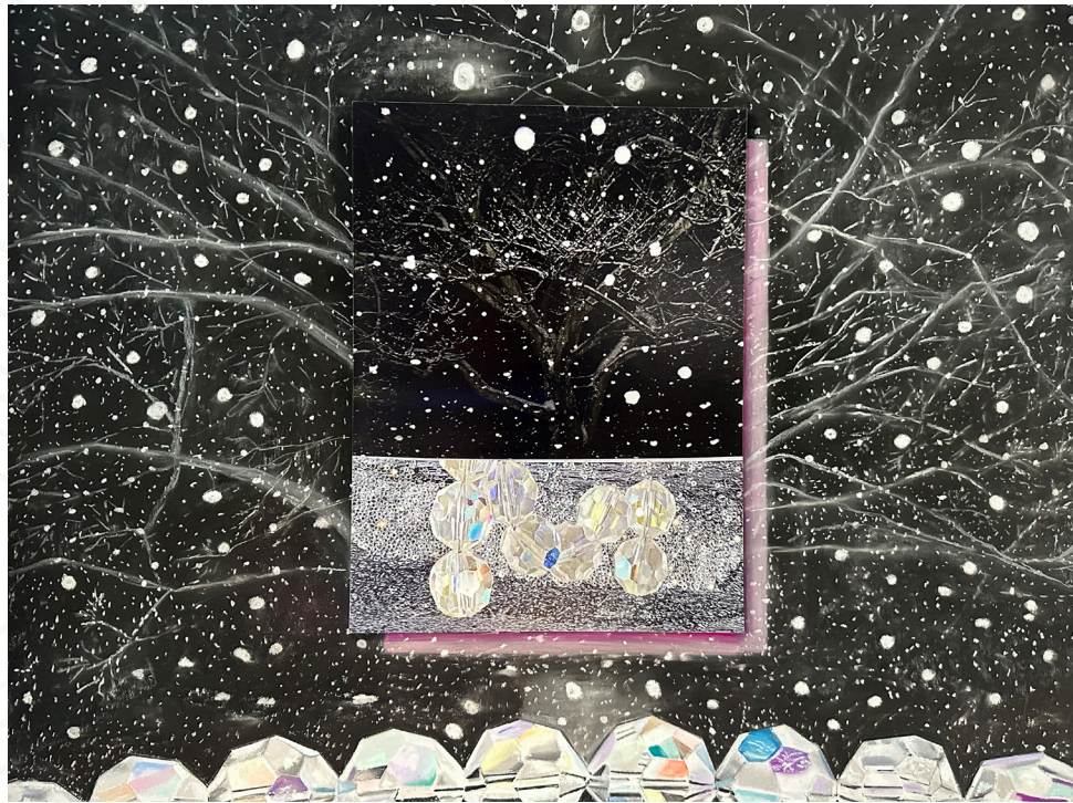
THE LUMINOSITY OF THE BLIZZARD