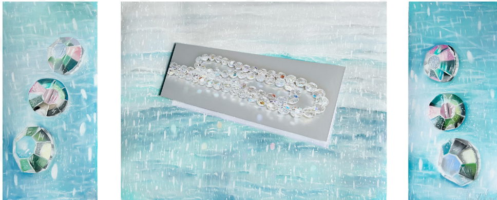
PERFECTION OF RAIN