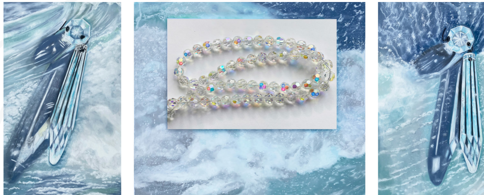
CRYSTALLIZATION OF THE WAVE